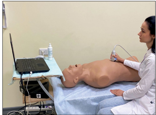
Fig. 6. A second-year resident using the simulator.

The use of the virtual simulator for knowledge assessment during resident certification and specialist accreditation yielded ambiguous results, requiring further discussion. In several similar studies, the authors emphasize the benefits of using simulators, particularly the lack of stress for certification candidates and conditions close to reality [8, 15]. These findings are consistent with the views of most students (95%), who chose to use the simulator during practical testing. Furthermore, this judgment was consistent before and after testing. However, according to the