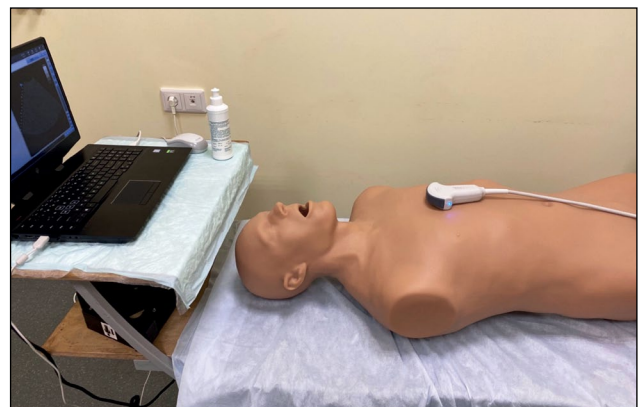
Fig. 1. Vimedix 3.2 virtual ultrasound simulator.

The results of using a Vimedix 3.2 virtual ultrasound simulator (CAE Healthcare, Canada) in the teaching process were analyzed. This simulator is the most widely available in both the Russian and foreign markets. It includes several mannequins and sensors for practicing ultrasound scanning techniques in various areas and an abnormal case database. The simulator includes an Omen laptop (Hewlett-Packard, USA) with wireless connection, a mouse, a male multipurpose mannequin, an array of ultrasonic convex sensor, and a sensor adapter (Fig. 1).