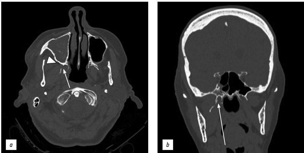
Fig 1: Axial (a) and coronal (b) CT scan with a bone window showing unilateral right pterygoid plate fracture (arrows) with air bubbles of emphysema (arrowheads) in the ipsilateral masticatory space.

Isolated pterygoid plate fractures are extremely rare. The study of Garg et al. [7] revealed that approximately two-thirds